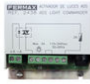
F02438 VDS LIGHT/BUZZER ACTIVATOR