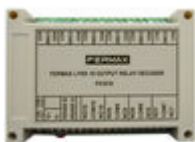
F01616 FERMAX MEET RELAY DECODER 10 OUTPUTS