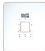
F03389 UNIVERSAL FRAME LARGE