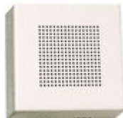
F02040 ELECTRONIC EXTENSION CALL