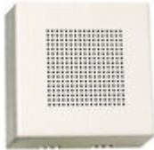
F02040 ELECTRONIC EXTENSION CALL