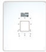
F03389 UNIVERSAL FRAME LARGE