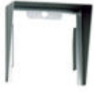
F08400 CITY SINGLE HOOD S1