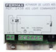
F02438 VDS LIGHT/BUZZER ACTIVATOR