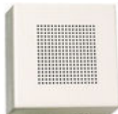
F02040 ELECTRONIC EXTENSION CALL