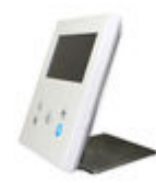
F09420 VEO-XS/VEO-XL MONITOR DESKTOP SUPPORT