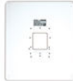
F03389 UNIVERSAL FRAME LARGE