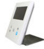
F09420 VEO-XS/VEO-XL MONITOR DESKTOP SUPPORT