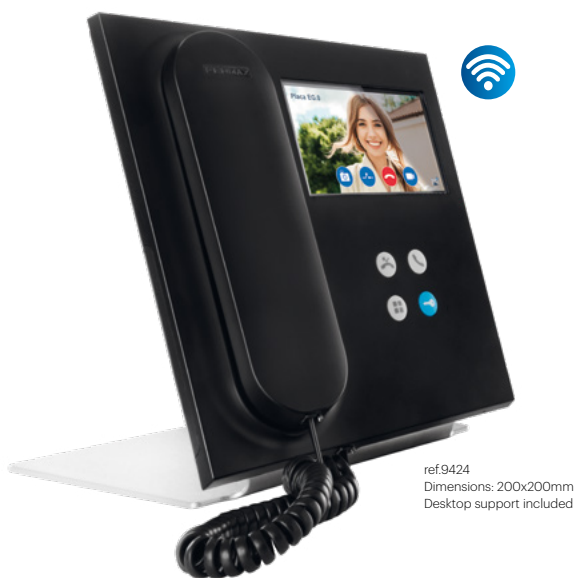
ref.9424 Dimensions: 200x200mm Desktop support included

Its unique handset design incorporating a magnet enables the end-user to put it back into position correctly. It includes a stainless steel desktop support. It allows a surface installation.